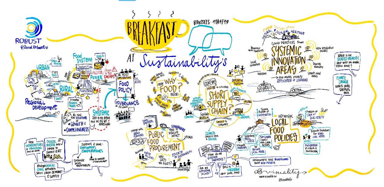
Figure 1 Final graphic illustration of the event (Visuality)

This event was graphically recorded. The final full-sized illustration can be viewed and downloaded from the Rural-Urban website here.