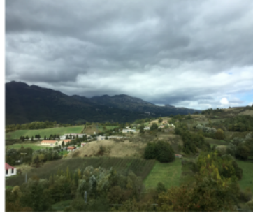
Castel del Giudice